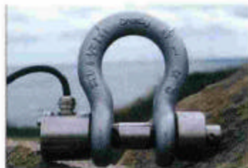
Cabled and Wireless Load Shackles