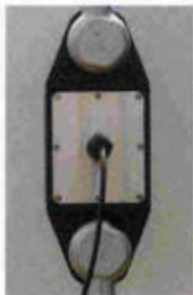
Cabled Load Link